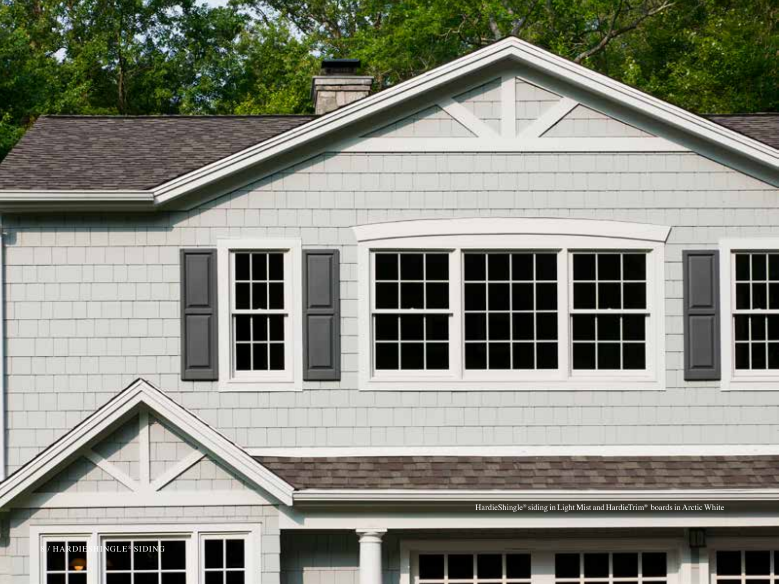
HardieShingle® siding in Light Mist and HardieTrim® boards in Arctic White