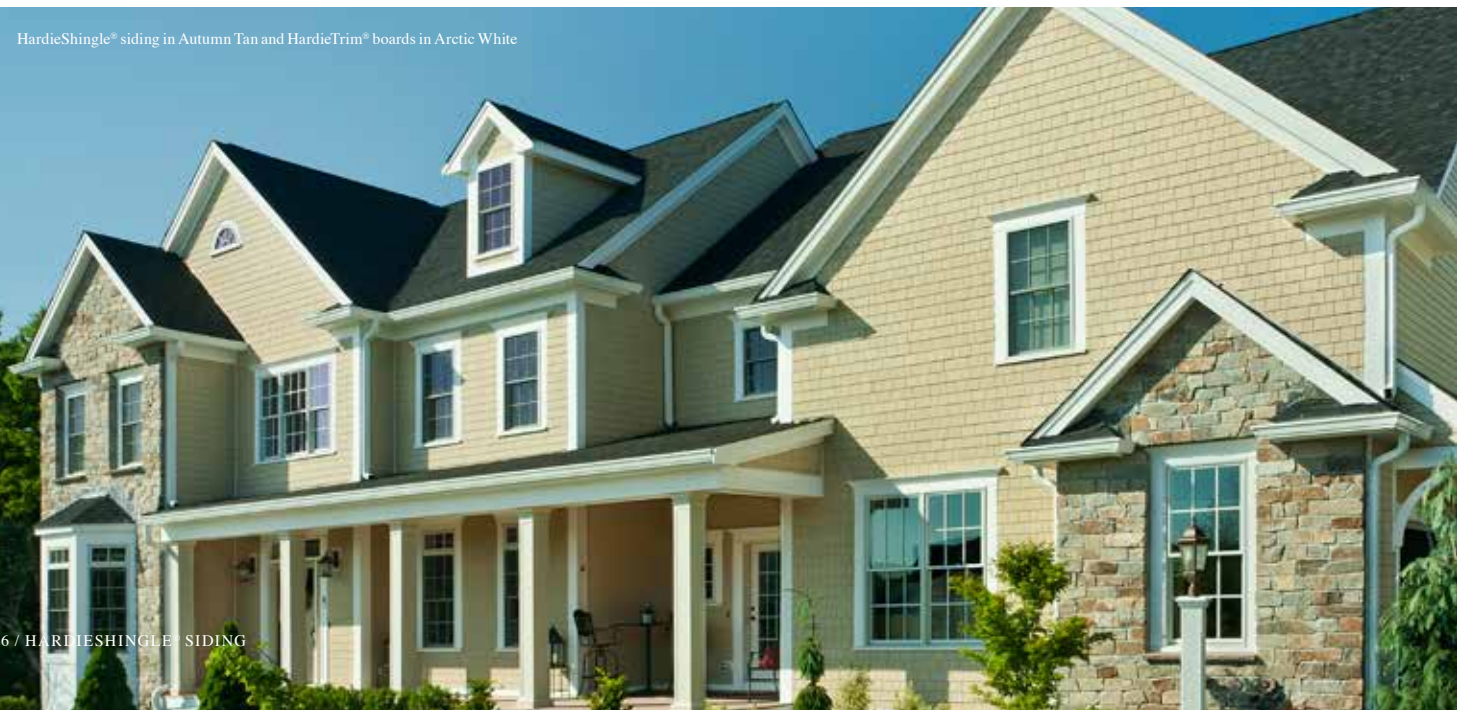
HardieShingle® siding in Autumn Tan and HardieTrim® boards in Arctic White

Offered in more than 20 colors, ColorPlus Technology reveals a beautiful, consistent finish. Plus, James Hardie siding with ColorPlus Technology holds its color 30%* longer than plastic-based siding products, which can't be repainted even if they have severely faded.